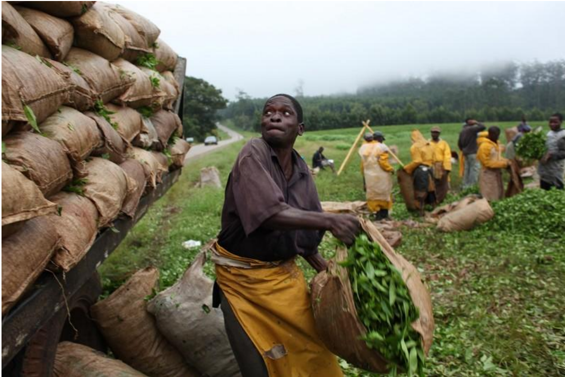
Tea pickers in Mulanje, southern Malawi. This is a form of casual labour known as ganyu. Many of the workers are elderly women who earn less because they work more slowly.

This briefing outlines the responsibility of businesses to respect human rights under the UN Guiding Principles on Business and Human Rights (UNGPs), also known as the Ruggie Framework. It provides an overview of the UNGPs and gives an Oxfam perspective, including case studies, on key issues for businesses.