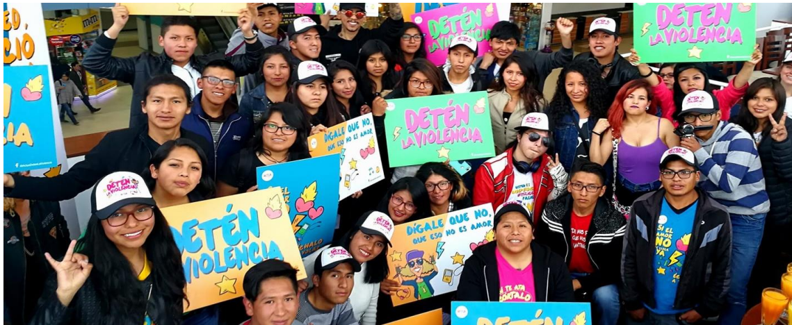
Young activists who are part of the ACTÚA, Detén la violencia campaign in Bolivia.

In the past 20 years, Bolivia has adopted laws and regulations aimed at ending VAWG. Despite these positive steps, research has found that Bolivia has the highest rate of physical violence in 13 countries across the LAC continent and the second highest, after Haiti, for sexual violence. 51 UN Women suggests 75% of Bolivian women have experienced some form of violence over their life time, 52 and the official numbers from the Bolivian government indicate that one woman is killed every three days. 53