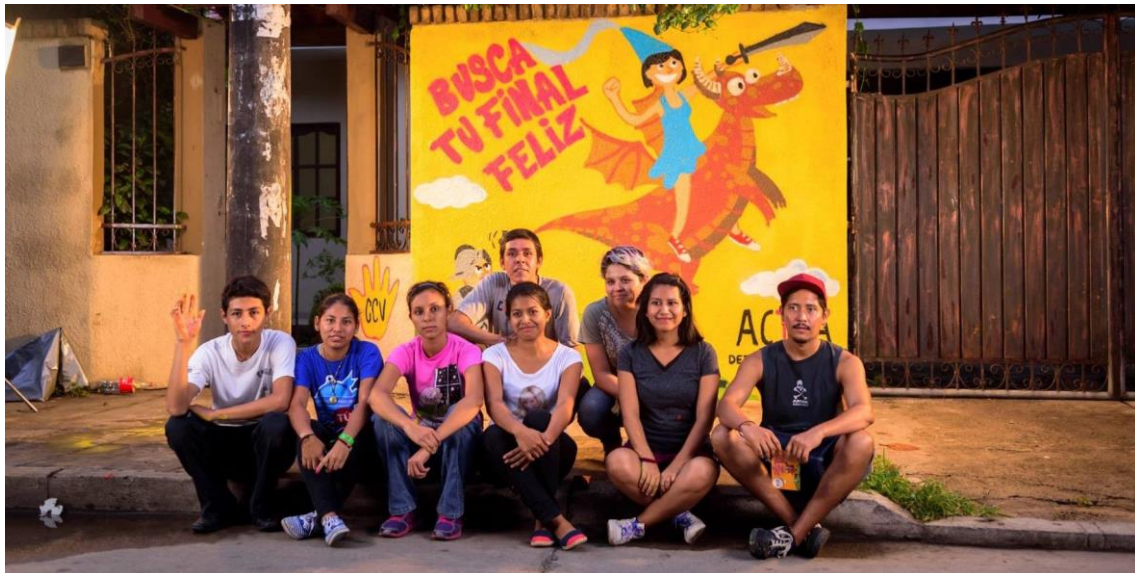
Cover photo: Young activists who are part of the ACTÚA, Detén la violencia campaign in Bolivia.

Identifying patterns in social norms contributing to violence against women and girls across Africa, Latin America and the Caribbean and the Pacific