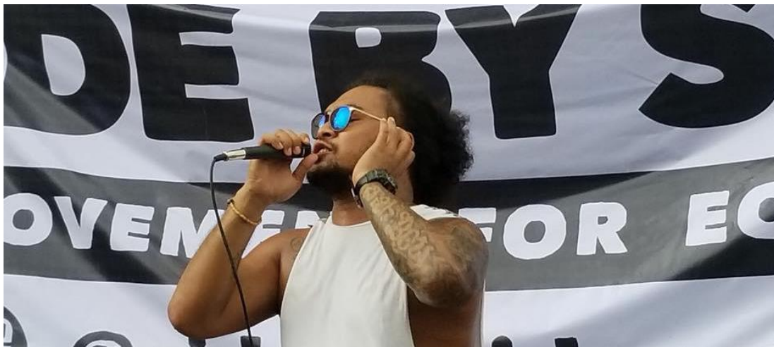
Oxfam in Solomon Islands' launch of the Side By Side Movement campaign with musicians. Photo: Oxfam in Solomon Islands. (2017)

Solomon Islands' cultures are incredibly diverse and predominantly patriarchal. Implicit within these cultures is a complex array of social and gender norms, which have been reinforced and strengthened over time through the process of colonization and exposure to Western institutions, including the church and government. 33 As a result, women experience vast and persistent gender inequality, which manifests itself in high rates of physical and sexual VAWG. For example, in 2009, 64% of women had experienced physical and/or sexual intimate partner violence in their lifetime. 34 More recently, there has been a dramatic increase in recorded crimes involving family violence, from 55 reported cases in 2012, to 65 in 2013 and 806 in 2014. From January to September 2015, 726 cases were recorded 35 as a result of improved legislation and implementation. 36