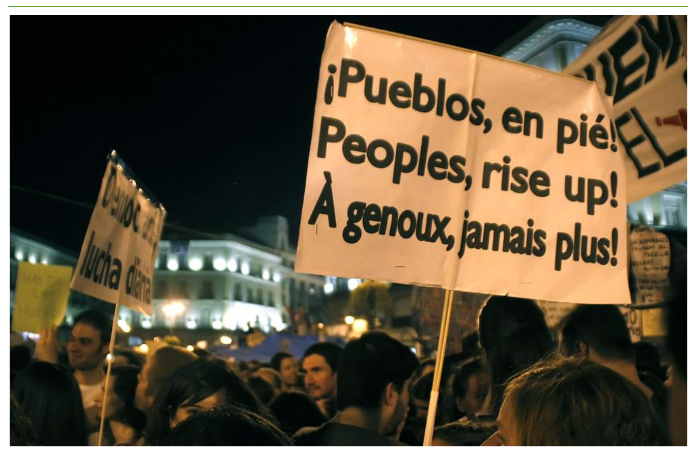
A 15M Movement protest against austerity measures in Madrid, May 2011.