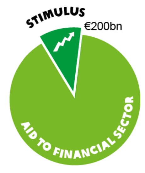
Figure 1: The EU economic recovery plan vs. Aid to the financial sector<sup>8</sup>